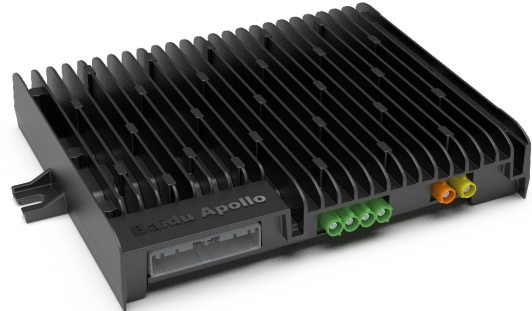
Figure 3: Baidu ACU jointly designed with Flex

The ACU system design strictly complies to ISO 26262 functional safety requirements, and system manufacturing strictly follows the IATF 16949 quality management system, which helps ensure high product quality.